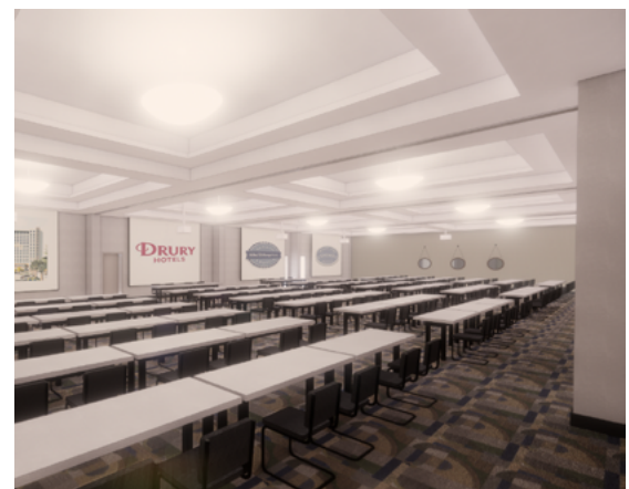
Actual meeting rooms may differ from photo.